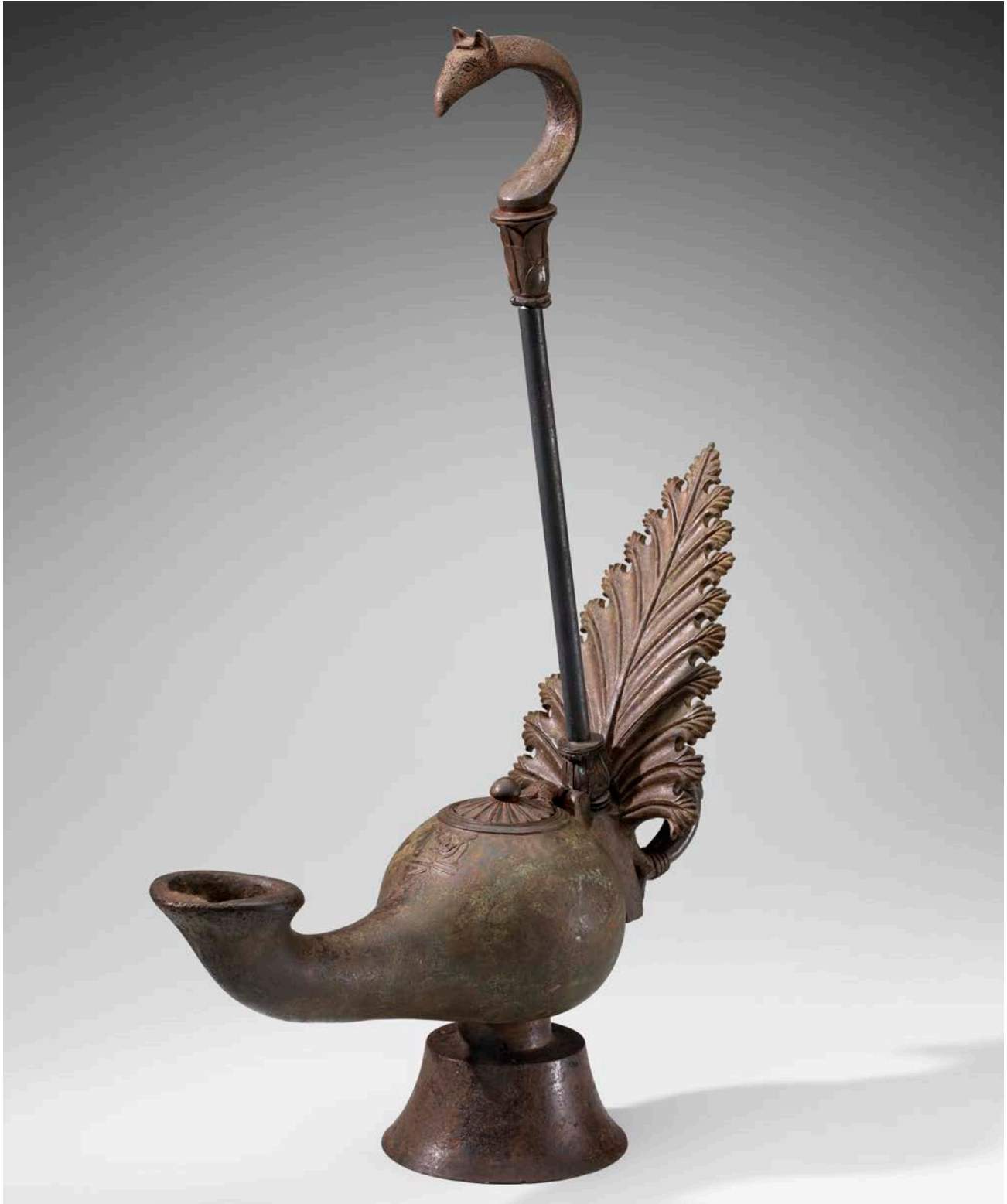
24.959 Hanging lamp, Nubian, Meroitic Period, reign of Takideamani, AD 140–55. Bronze. 62 x 12.5 x 39.7 cm. Harvard University—Boston Museum of Fine Arts Expedition.