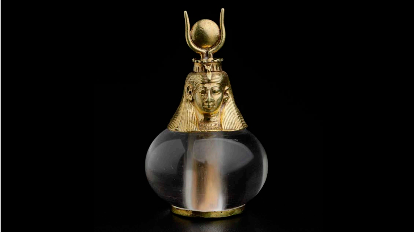
21.321 Hathor-headed crystal pendant, Nubian, Napatan Period, reign of Piankhy (Piye), 743–712 BC. Gold, rock crystal. 5.3 x 3.3 cm. Harvard University—Boston Museum of Fine Arts Expedition.

Although frequently eclipsed in the public imagination by its northern neighbor Egypt, ancient Nubia has a long and glorious past. There, in what is today Sudan, a series of civilizations flourished for more than 6,000 years. Nubia's location made it a strategic link between Central and Eastern Africa, Egypt, Western Asia, and the Mediterranean. The artistic achievements of the Nubians include fine ceramics, exquisite jewelry and decorative arts, impressive buildings, stone sculpture and relief, and pyramid tombs.