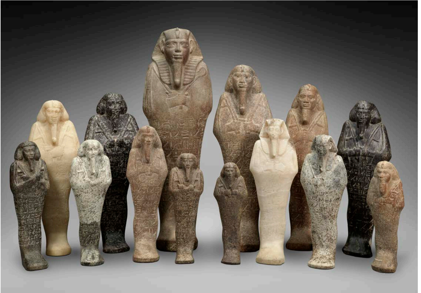
20.225 Shawabty of King Taharqa, Nubian, Napatan Period, reign of Taharqa, 690–664 BC. Gray serpentinite. 34.2 x 12.5 cm. Harvard University—Boston Museum of Fine Arts Expedition.