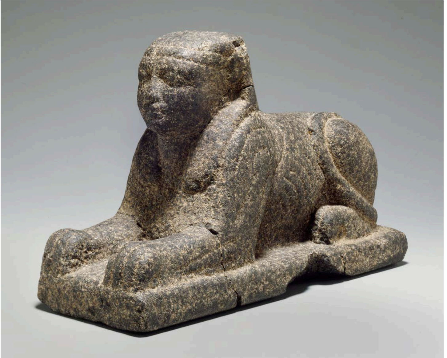
21.2633 Sphinx, Nubian, Meroitic Period, AD 1st–4th century. Black granodiorite. 22.8 x 12.1 x 30.8 cm. Harvard University—Boston Museum of Fine Arts Expedition.