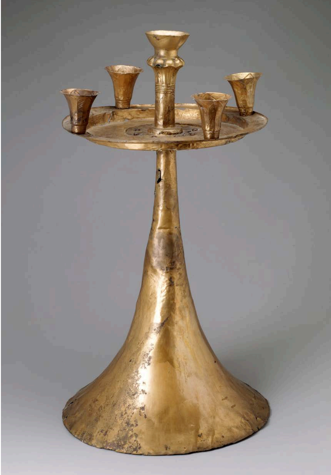
21.3238 Offering table of King Piankhy (Piye), Nubian, Napatan Period, reign of Piankhy (Piye), 747–716 BC. Gilded bronze. 82 x 45.5 cm. Harvard University—Boston Museum of Fine Arts Expedition.