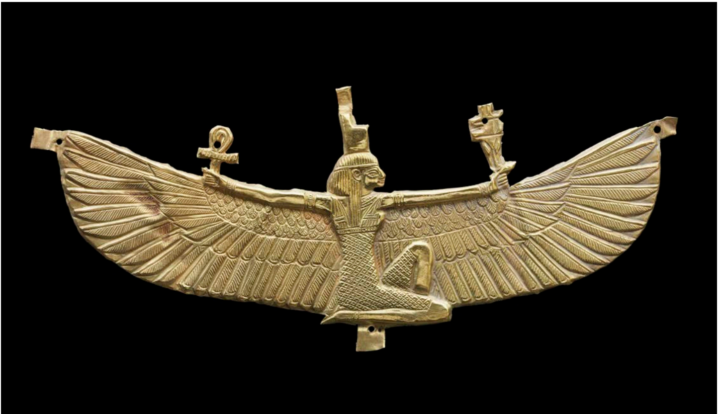
20.276 Winged Isis pectoral, Nubian, Napatan Period, reign of Amaninatakelepte, 538–519 BC. Gold. 6.9 x 17 cm. Harvard University—Boston Museum of Fine Arts Expedition.