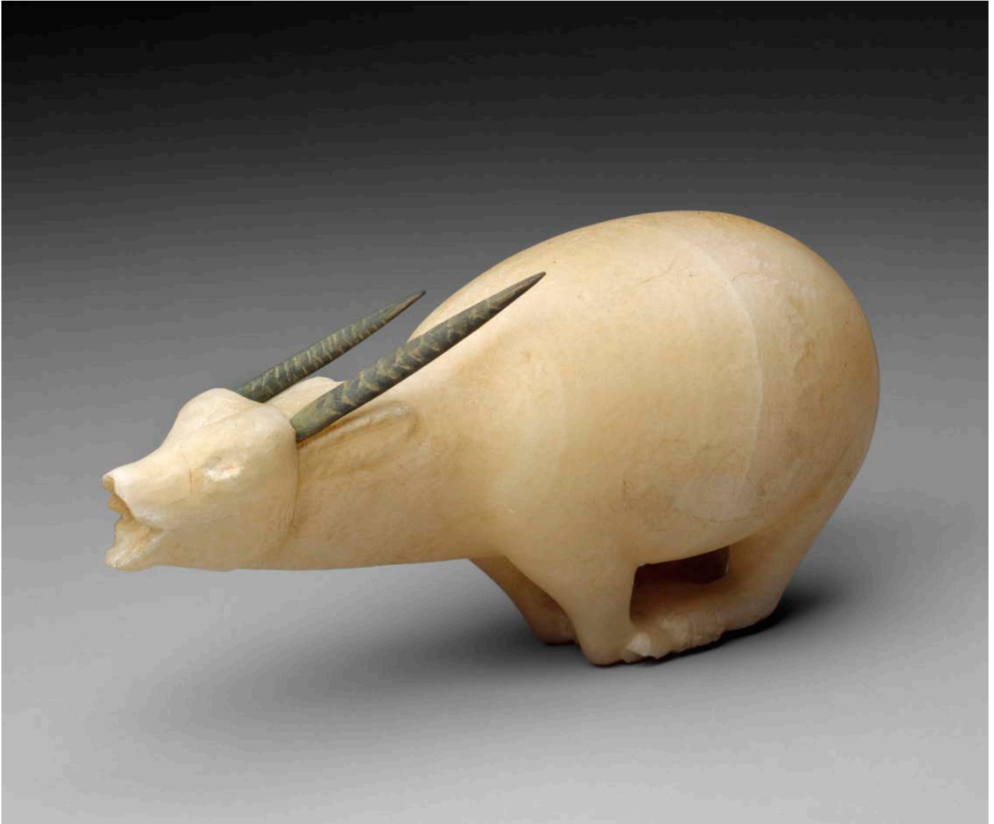
24.879 Vessel in the shape of a bound oryx, Nubian, Napatan Period, early 7th century BC. Travertine (Egyptian alabaster). 17.14 cm. Harvard University—Boston Museum of Fine Arts Expedition.

Final object checklist pending approval.