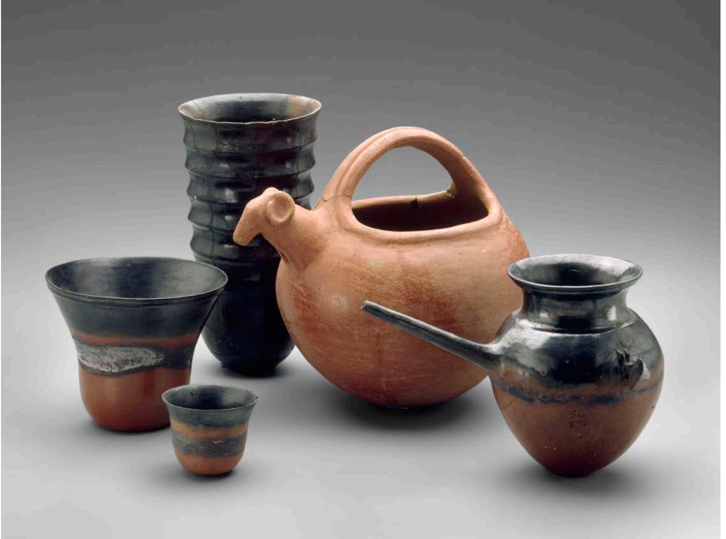
20.2006 Rilled beaker, Nubian, Classic Kerma, about 1700–1550 BC. Pottery. 24 x 14 cm. Harvard University—Boston Museum of Fine Arts Expedition.