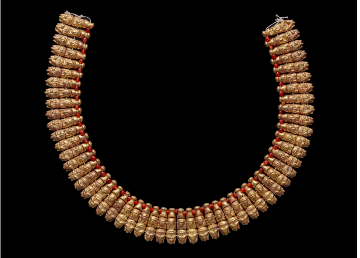
23.366 Necklace with human and ram's head pendants, Nubian, Meroitic Period, 270–250 BC. Gold and carnelian. 38 x 2.4 cm. Harvard University—Boston Museum of Fine Arts Expedition.