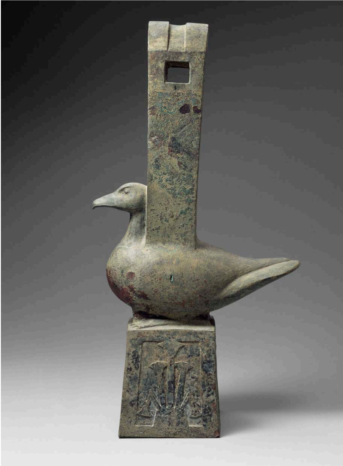
21.2815 Leg from a funerary bed, Nubian, Napatan Period, reign of Shebitka, 698–690 BC. Bronze. 56.1 x 13 x 30.5 cm. Harvard University—Boston Museum of Fine Arts Expedition.