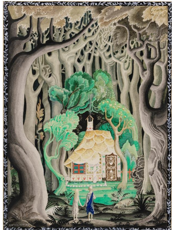
08. Illustration from Hansel and Gretel and Other Stories by the Brothers Grimm (published 1925), 1924