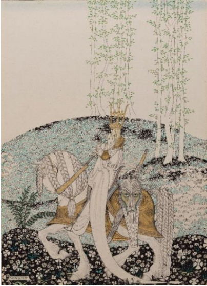
01. Illustration from East of the Sun and West of the Moon, Old Tales from the North (published 1914), 1913–1914

Unless otherwise noted, all works by Kay Nielsen (Danish, 1886–1957)