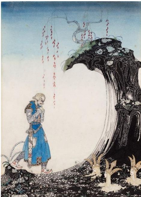
03. Illustration from East of the Sun and West of the Moon, Old Tales from the North (published 1914), 1914