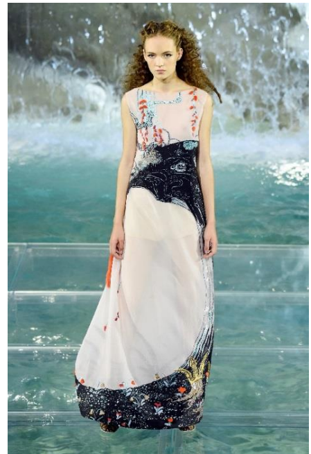
04. Evening gown from " Legends and Fairy Tales " collection, 2016, Karl Lagerfeld