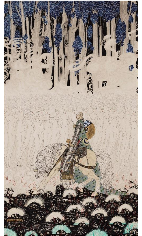
06. Sir Olaf and the Underworld, 1913