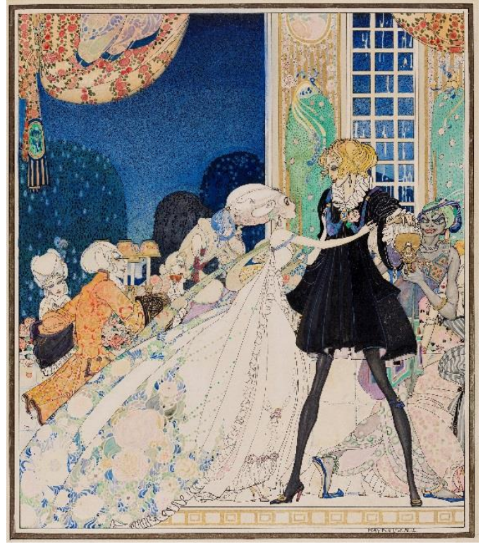
10. Illustration from In Powder and Crinoline (published 1913), 1912