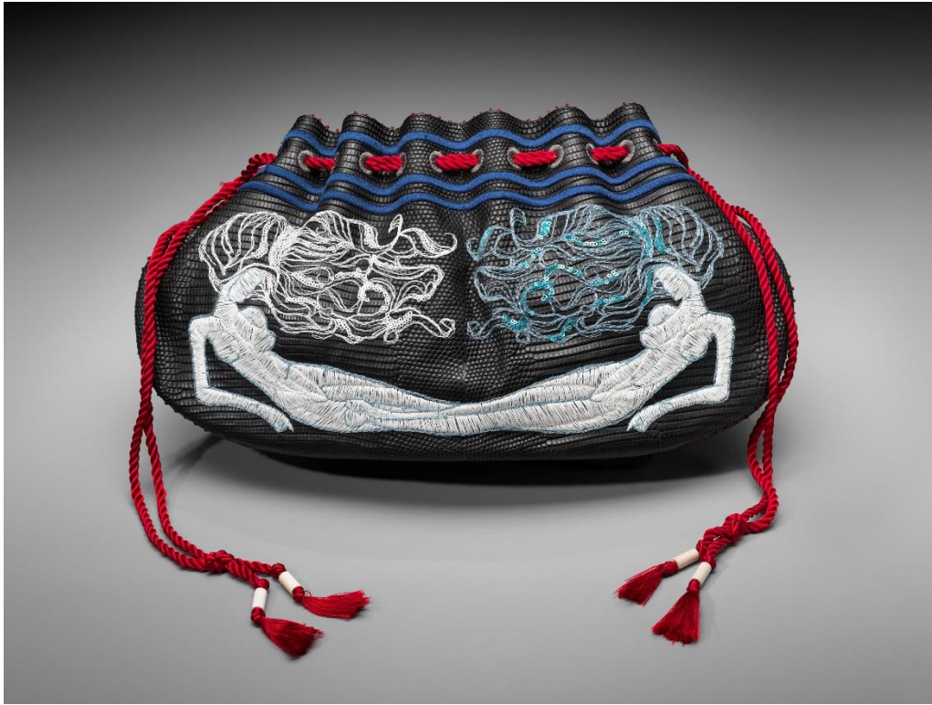
05. Evening bag from "Legends and Fairy Tales" collection, 2016, Karl Lagerfeld