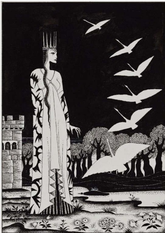
11. Illustration from Red Magic (published 1930), 1930