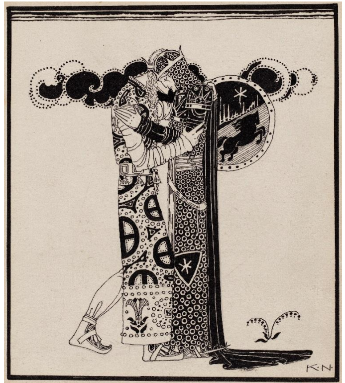
12. Illustration from East of the Sun and West of the Moon, Old Tales from the North (published 1914), 1913–1914