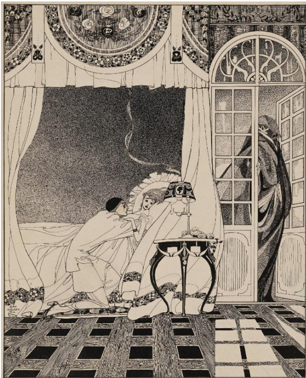
07. Inevitable, from The Book of Death series, 1910