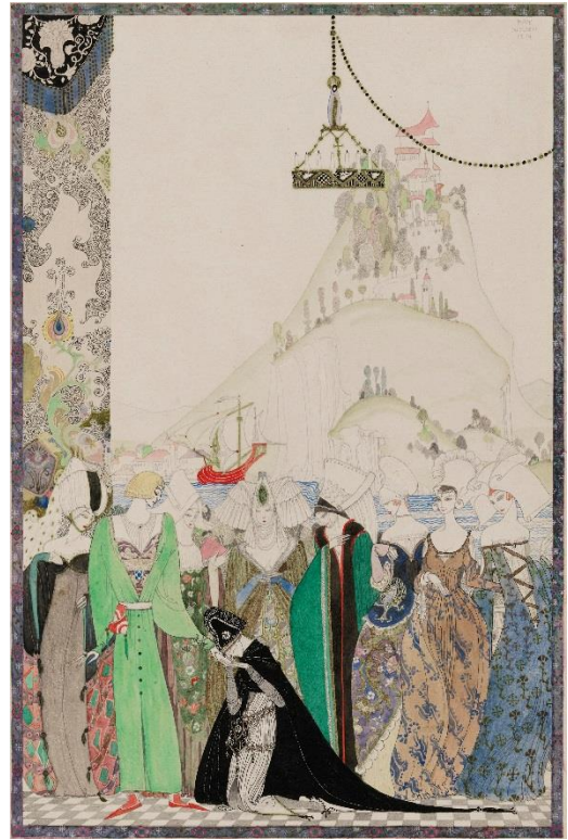
14. Illustration from the Joan of Arc series, 1914

The enclosed images are provided to you solely for your one time use to illustrate original news stories or educational articles written and published about the exhibition “Kay Nielsen’s Enchanted Vision: The Kendra and Allan Daniel Collection” (July 20, 2019 – January 20, 2020). Please return or destroy these materials after this time.