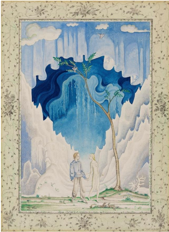
13. Illustration from Fairy Tales by Hans Andersen (published 1924), about 1924