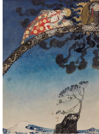
02. Illustration from East of the Sun and West of the Moon, Old Tales from the North (published 1914), 1913